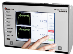
Optional AWS3 Touchscreen Display with additional features