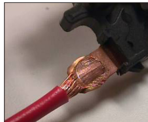
Stranded Wire to Coil